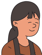
Soo - 8