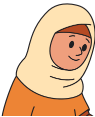
Reese - 20