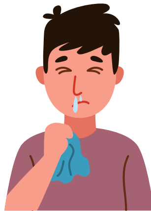
A RUNNY NOSE