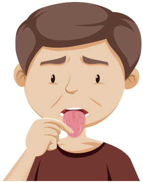
A DRY MOUTH