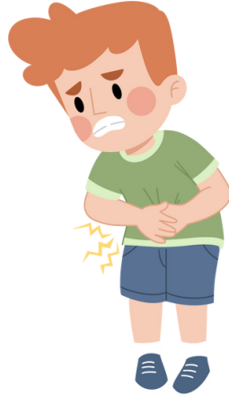
A STOMACH ACHE