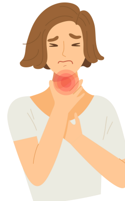
A SORE THROAT