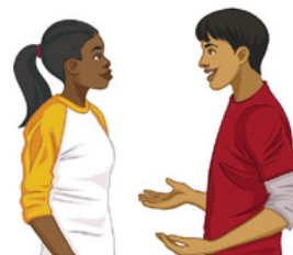
talking to friends